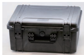
Hard Carrying Case